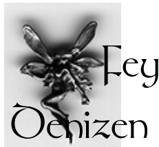
-Sean T. Hammond

Also in a day and age when parent groups are concerned what their kids will be exposed to on the internet, I wonder if they put much thought into what their kids are exposed to when they drop them off at a friend's, relative's or even some stranger's house. Not all molestation is physical.